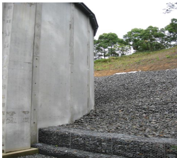
Figure 2 Site access restricted

The reservoir site should be selected with consideration of future growth. The original reservoir may have fantastic access and tick all the boxes, but a second, future installation may not. Bringing this consideration into a new reservoir design can only assist the following generations.