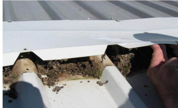
Figure 5 Debris build-up under roof flashing