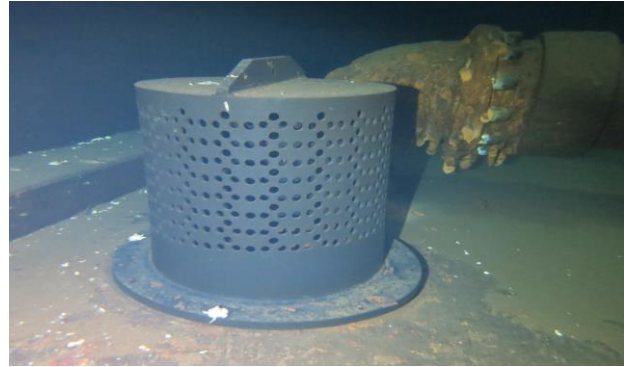
Figure 10 HDPE outlet screen – good result

Reducing the amount of exposed pipework within the reservoir has a two-fold benefit. Firstly, less pipe work reduces the chlorine demand due to corrosion (if un-coated steel is used) and requires less maintenance to replace in the future. Secondly, there are fewer obstacles for divers (or robots!) to navigate around when cleaning and inspecting.