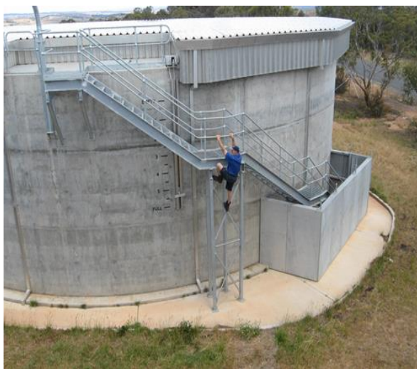
Figure 1 Security measures easily bypassed

This section covers a broad spectrum of issues including contamination prevention, worker safety and future growth. Access begins with the tank site and ease of movement for vehicles. The main consideration here is what maintenance vehicles will be required? Cranes and EWP equipment will need a decent set down area for outriggers and also solid ground. The greater the space available, the easier it is to avoid underground pipe work. Maintenance trucks require close access to the main ladder for moving gear up to the roof area.