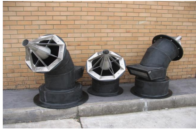
Figure 8 Inlet directional nozzles – good results