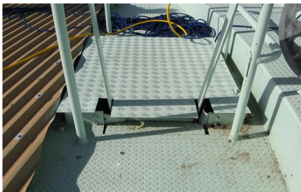
Figure 3 Unsealed entry hatch area

With heightened awareness of fall prevention, holes have often been cut into hatch covers to allow for ladder stiles to extend through - this unfortunately results in a potential contamination point as the hatch is no longer sealed. Similarly, the front edges have been removed to eliminate trip hazards – this has allowed the platform area (with its usual amounts of residual contaminants) to drain into the reservoir.