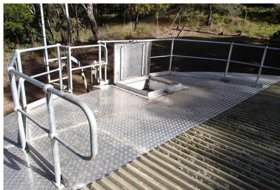
Figure 4 Good platform design

Some design considerations for hatches and platforms: