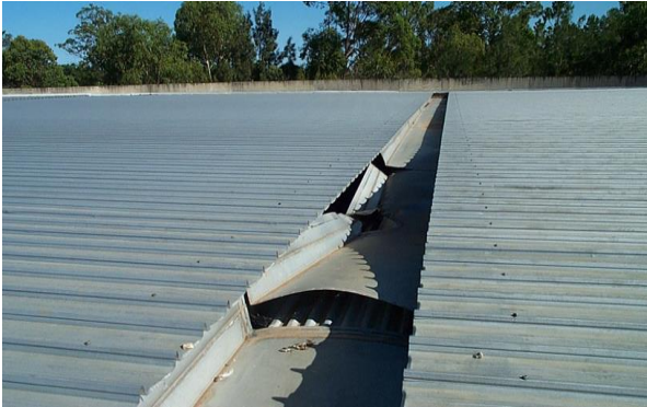
Figure 6 Collapsed roof gutter

These all have the potential to contaminate the water supply they intend on protecting.